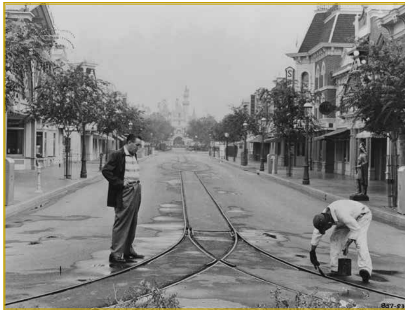
MAIN STREET, U.S.A. DISNEYLAND PARK, CALIFORNIA (1957)