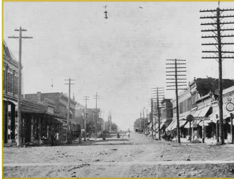
WALT'S HOME TOWN MARCELINE, MISSOURI (c. 1905)